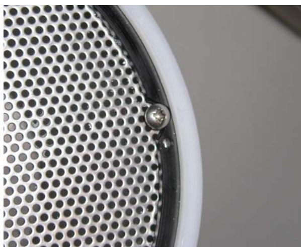
The POM ring is fixed for with a screw, to make sure it cannot open accidently.