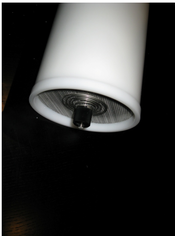
The upper part, scrubber nearly completely filled- with tightened spring

Filling the cartridge with soda sorb has to follow the general rules of filling a scrubber. You have to ensure the soda is packed well. Fill half and shake well, then fill two thirds and shake, finally fill the scrubber and shake it well. Then put on the top sieve, spring and nut. Tighten the spring to max tension and shake the scrubber again.